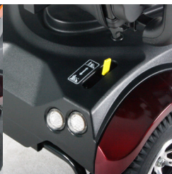
Photo 13 Freewheel position