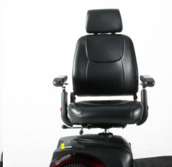
Photo 11 Rotated seat position