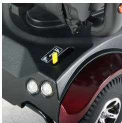
Photo 12 Drive position

The Excel Roadster DX8 Deluxe has two settings, namely the drive setting and freewheel setting (see photos 12 and 13). The scooter should always be in drive when you want to use it. The freewheel setting allows you to move the scooter without turning it on. When the scooter is put in freewheel mode, it can be pushed without the motor giving resistance.