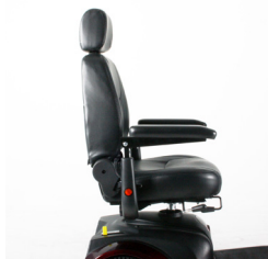
Photo 9 Side seat position