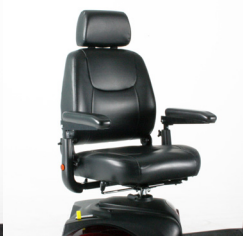
Photo 10 Angled seat position