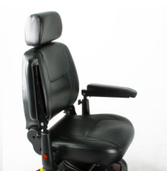
Photo 5 Up armrest