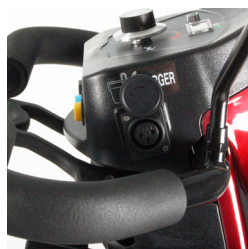
Photo 14 Charging port

The Excel Roadster DX8 Deluxe is equipped with two closed, maintenance free batteries. Van Os Medical recommends to charge the batteries fully before first use. We advise you to charge them for at least 12 continuous hours. The charger port is located on the tiller (see photo 14). The batteries of the Excel Roadster DX8 Deluxe can not be removed for the purpose of charging.