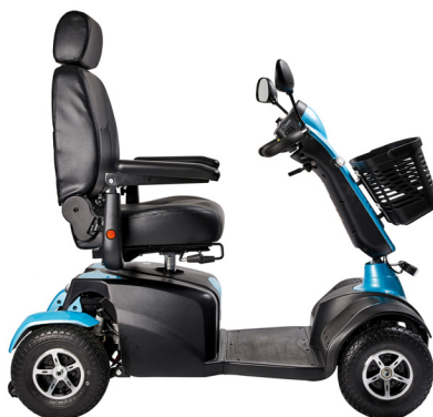
Photo 3 Angled tiller position