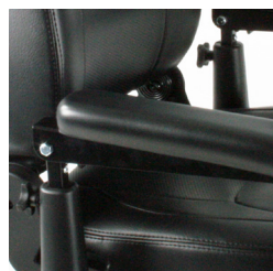
Photo 6 Height adjustment star knobs

Not only can the armrests of the Excel Roadster DX8 Deluxe be flipped up, they can also be adjusted in height. To adjust the height of the armrests, unscrew the star knob on the back of each armrest (see photo 6) until the arms have loosened. Then pull or push each arm up or down to adjust the armrest height. When the desired armrest height has been achieved, re-screw the star knobs until the armrests are fixed in position.