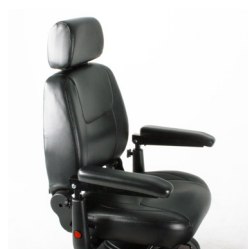
Photo 4 Down armrest

The Excel Roadster DX8 Deluxe is equipped with height and width adjustable flip-back removable armrests. To flip the armrests up, simply pull the armrests upwards. This makes getting on and off your scooter easier to do.