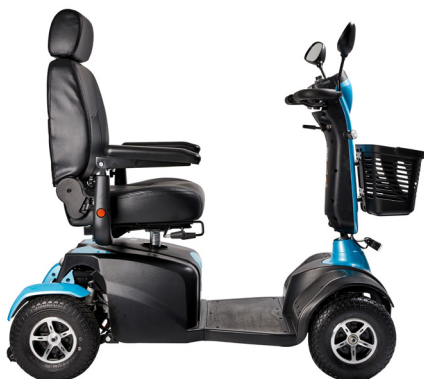
Photo 2 Upright tiller position