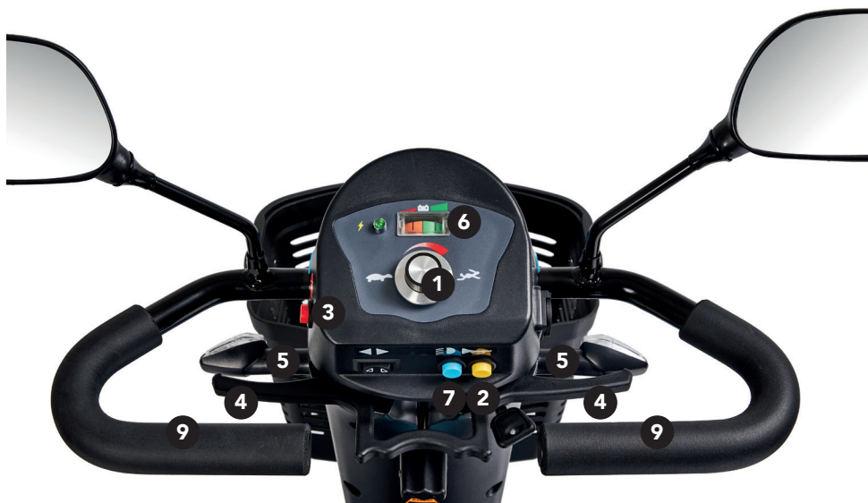
Photo 1 Dashboard display

The Excel Roadster DX8 Deluxe is equipped with a clear dashboard. The dashboard consists of different components that all have a different function. Below, several components are explained further: