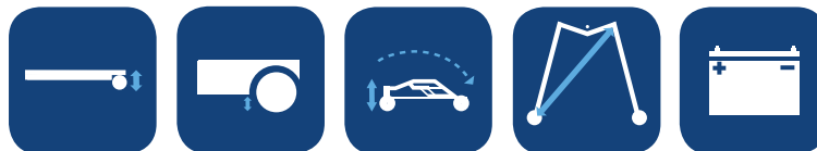
Height of legs ▼ Ground clearance ▼ Height when folded ▼ Turning diameter ▼ *Working ability ▼