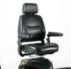
Photo 10 Angled seat position