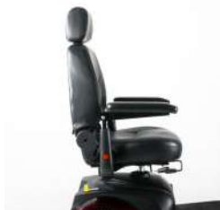
Photo 9 Side seat position