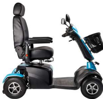
Photo 3 Angled tiller position