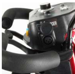
Photo 14 Charging port

The Excel Roadster DX8 Deluxe is equipped with two closed, maintenance free batteries. Van Os Medical recommends to charge the batteries fully before first use. We advise you to charge them for at least 12 continuous hours. The charger port is located on the tiller (see photo 14). The batteries of the Excel Roadster DX8 Deluxe can not be removed for the purpose of charging.