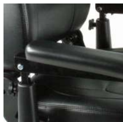
Photo 6 Height adjustment star knobs

Not only can the armrests of the Excel Roadster DX8 Deluxe be flipped up, they can also be adjusted in height. To adjust the height of the armrests, unscrew the star knob on the back of each armrest (see photo 6) until the arms have loosened. Then pull or push each arm up or down to adjust the armrest height. When the desired armrest height has been achieved, re-screw the star knobs until the armrests are fixed in position.