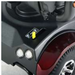
Photo 12 Drive position

The Excel Roadster DX8 Deluxe has two settings, namely the drive setting and freewheel setting (see photos 12 and 13). The scooter should always be in drive when you want to use it. The freewheel setting allows you to move the scooter without turning it on. When the scooter is put in freewheel mode, it can be pushed without the motor giving resistance.