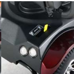
Photo 13 Freewheel position