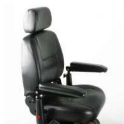
Photo 4 Down armrest

The Excel Roadster DX8 Deluxe is equipped with height and width adjustable flip-back removable armrests. To flip the armrests up, simply pull the armrests upwards. This makes getting on and off your scooter easier to do.