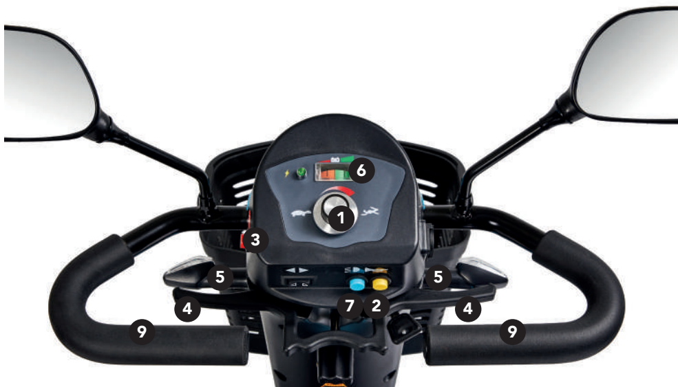
Photo 1 Dashboard display

The Excel Roadster DX8 Deluxe is equipped with a clear dashboard. The dashboard consists of different components that all have a different function. Below, several components are explained further: