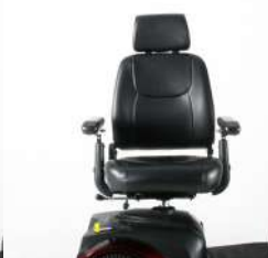
Photo 11 Rotated seat position