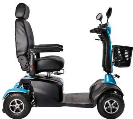
Photo 2 Upright tiller position