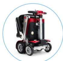
Folds or unfolds easily within 15 seconds

If you would like to view this product please contact your local stockist.