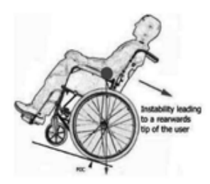
Figure 6 Unstable (slope too steep)